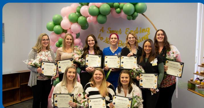
Nurse Residency Graduation